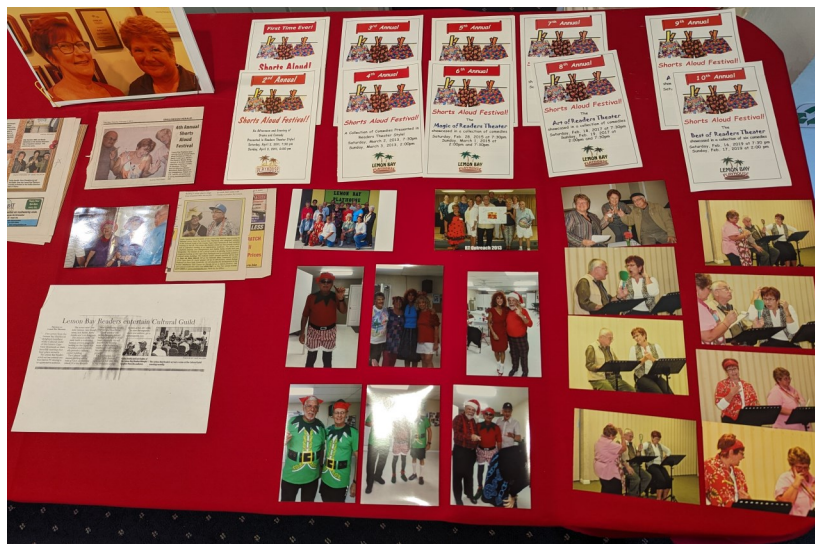
Reader's Theatre photos and brochures that survived.