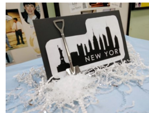
Prisoner of Second Ave.