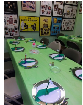
Fox on the Fairway