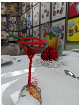
Savannah Sipping Society