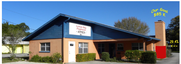
GRAPHICAL REPRESENTATION OF OUR ACHIEVEMENT TO DATE

Several months after the purchase of the Annex, the fundraising campaign was initiated to pay down the $85,000 mortgage. Through your generosity, the donations of money, time, and talent have brought us close to 30% of our goal. We have presently raised about $25,000. Thank you all very much. We hope to reach our goal in 2015. Therefore, you will be hearing more about our efforts on this campaign in the near future.