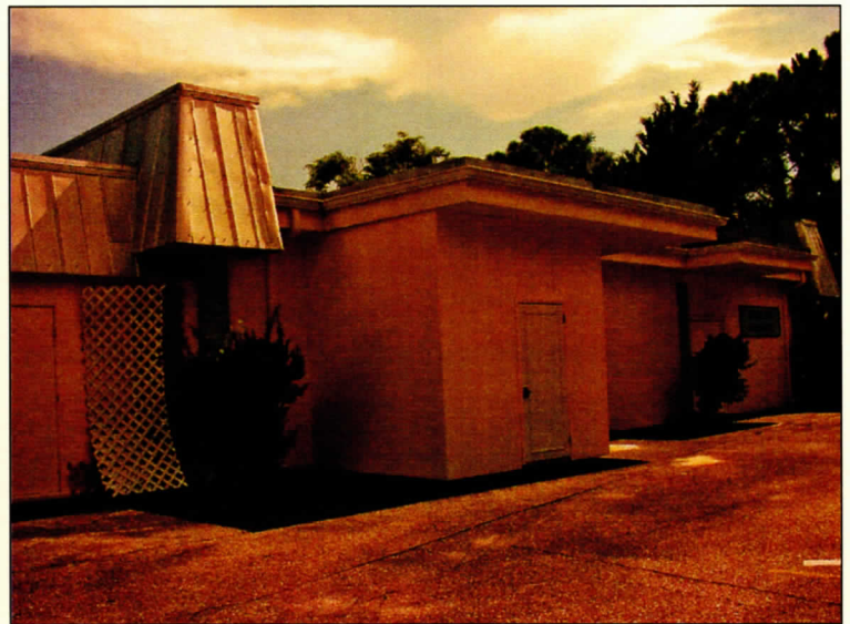
The finished product