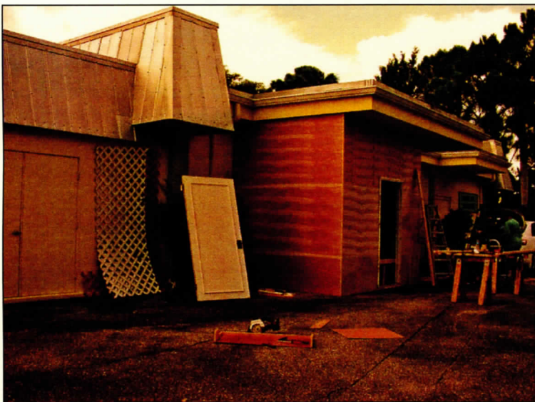
Jim Sciarelo (standing) and Jim Suchomel choose just the right tool.

A ugust brought a new look to the rear of LBP building. Driving around the back of the theater, you will notice a temporary enclosure under the roofed area. We are getting ready for our second play of the season, "Absurd Person Singular". It takes place in 3 different kitchens belonging to couples of 3 different economic levels. Since we have virtually no wing space on the stage, the addition was built to accommodate moving set pieces on and off the stage. Jim Suchomel and his crew enclosed an 8 ft. by 10 ft. space with a floor that is raised 16 in. above the parking lot surface. This makes it level with the stage, so our backstage crew can quickly roll kitchen pieces in and out. We want to thank Jim Suchomel, Bob Gschwend, Chuck Heady, Bruce Herget, Jerry Price, Jim Sciarelo, Rob Sprague, Steve Stump, and Dale Wallace for all of their hard work.