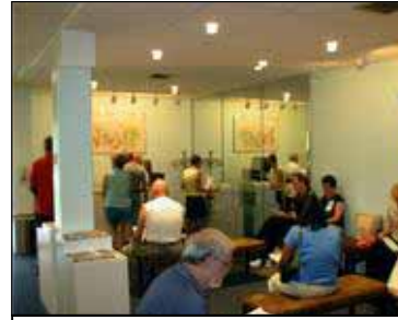
Actors filled the Playhouse for the open audition.

Our July 11 th open auditions were very successful with a total of 29 actors auditioning. Out of the 29, there were 12 new to our theater. Each actor read two monologues, one comedy and one drama.